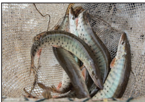
Above: MN DNR personnel released muskie yearlings into Lake Waconia. Above right: Olin Knutson helped release muskies into Bald Eagle Lake. Below right: The yearlings stocked in various lakes this fall were 17-18 inches. A recent DNR Metro Stocking Study has shown that yearlings are 4 to 5 times more likely to survive than traditional fall fingerlings. Essentially, the 1,500 yearlings stocked is the equivalent of stocking 6,000 to 7,500 fingerlings.