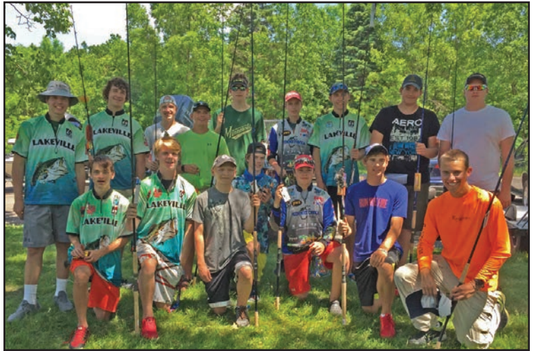
Nine teams from four area high schools competed in the Twin Cities chapter qualifier on June 9 on Lake Independence