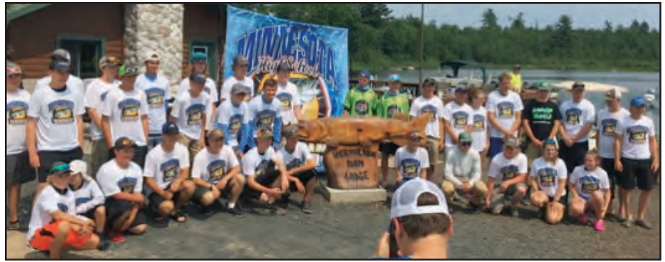
Eighteen 2-man teams from 13 high schools participated in the 9th Annual Minnesota State High School Tournament June 22 on Lake Vermilion.