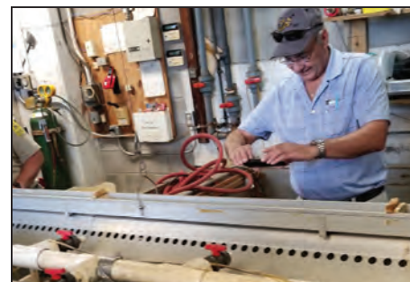
50,000 fry are being raised at the MN DNR's East Metro Hatchery. Hopefully your trophy is swimming among them.