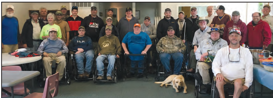
Members of the Capable Partners organization went muskie fishing with chapter members.