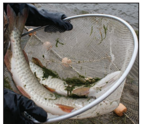
The last time we were involved in netting a pond, the muskies had over-wintered in the pond and were twice as big as the muskies that will be harvested this year.