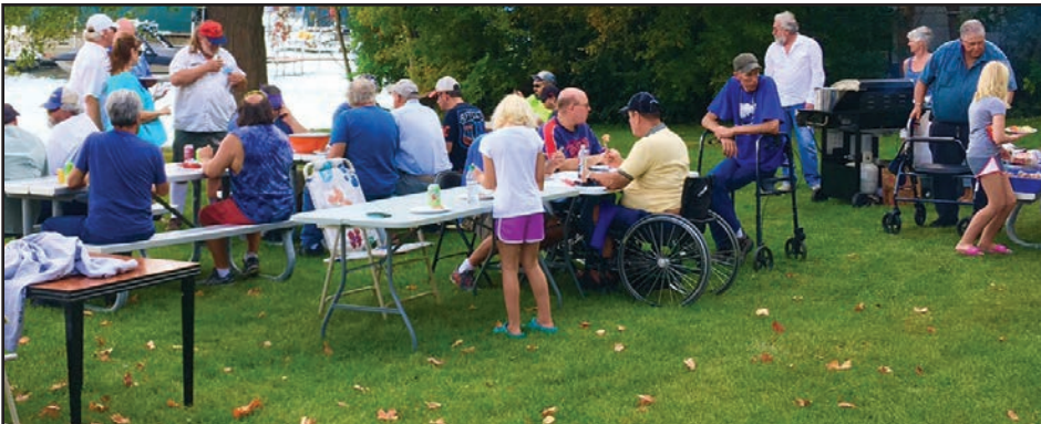
After a morning of fishing, Capable Partners anglers, guides, and chapter volunteers enjoyed a delicious meal.