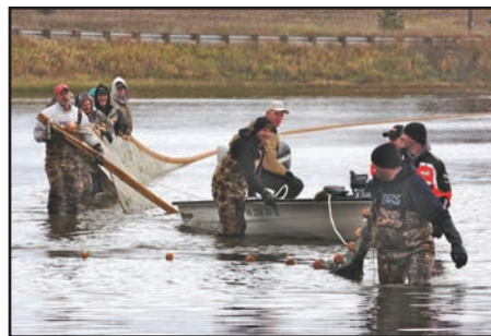
The last time our chapter was involved in harvesting muskies was nearly ten years ago. The pictures here are from that and previous harvests. A huge net was stretched around the perimeter of the pond and pulled toward one end forcing the muskies into a smaller and smaller area of the pond.