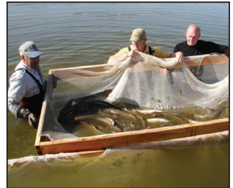
Once corralled in the net, the muskies were put into holding areas where they could be caught and transferred to the transport truck.