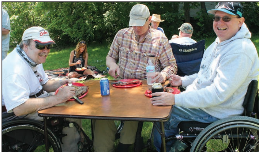
Members of Capable Partners enjoyed an awesome lunch after a morning of muskie fishing at last year's outing. Six muskies, including a 51-incher and numerous other species were boated at the event last year.