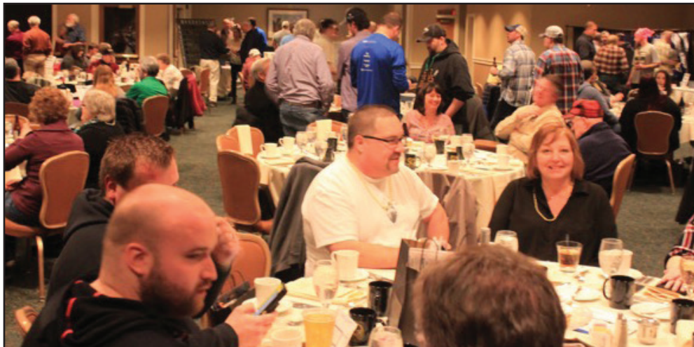
Over 130 attendees enjoyed a fun evening at the Sportsman's Banquet on January 21. More inside.