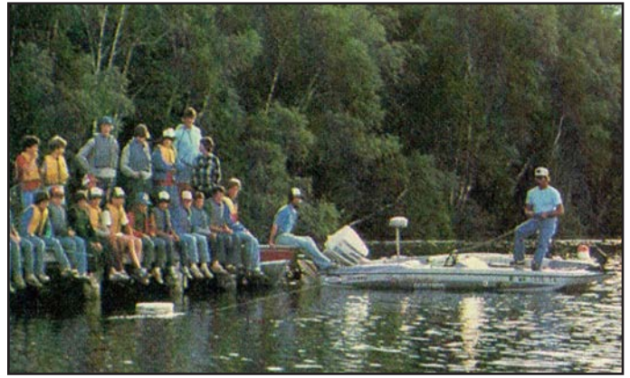
During the 1980s several “Muskie, Inc. weeks” were held over the years with kids from Muskie, Inc. families attending.