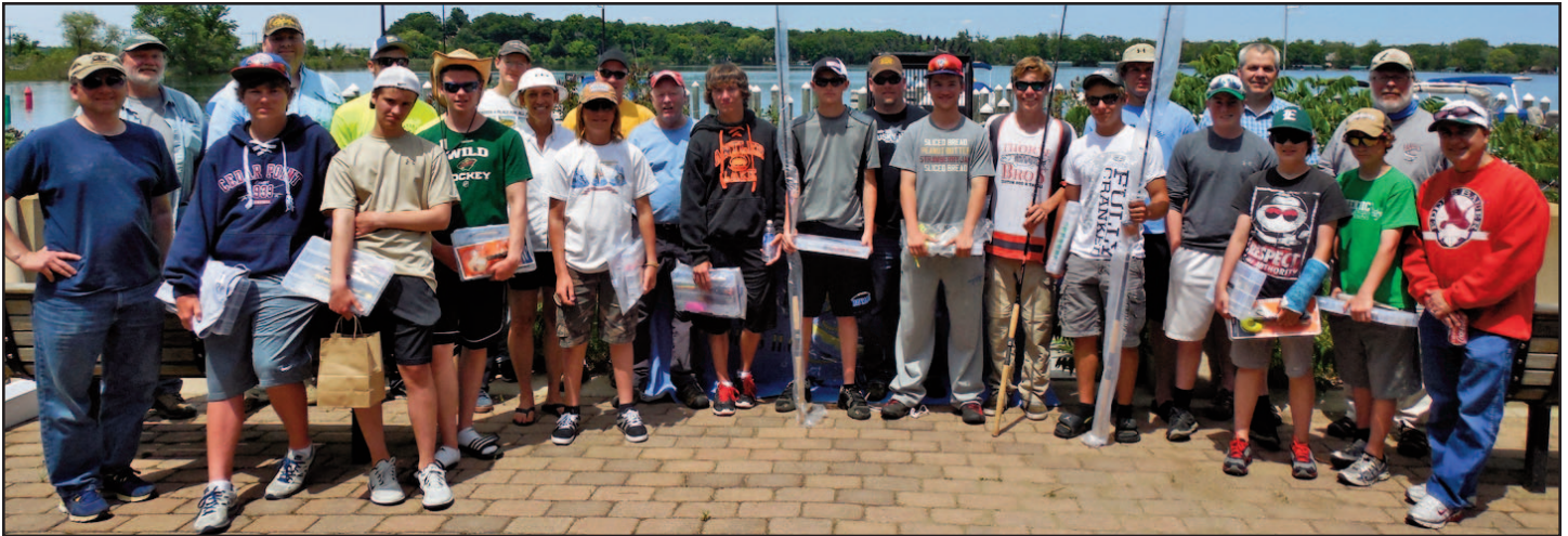
Eight student teams representing six different high schools competed in the regional qualifier held by the Twin Cities chapter.