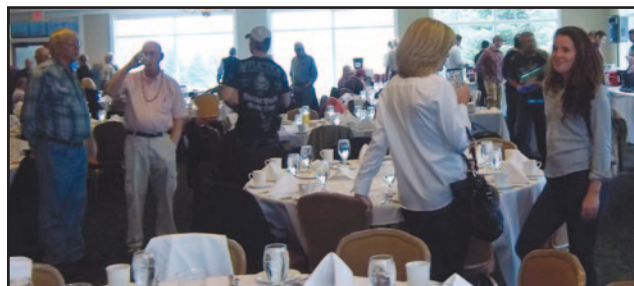
Scenes from the 2012 Sportsman's Banquet. Come join us at this year's Banquet on March 9. There will be lots of items like the ones here. Doors open at 5:00 pm to allow lots of time to mingle and get in on the various raffles and silent auction.

$105, includes dinner and $90 in Muskie Bucks. Muskie Bucks are used to purchase tickets for the raffles and various events throughout the evening. Dinner only is $35.