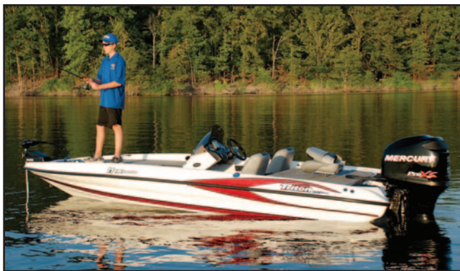
A Triton 17 Explorer boat/motor/trailer package is with Grand Prize for the Frank Schneider Tournament.

The Frank Schneider tournament is not a big-time team event. For most contestants this is the only tournament they fish in during the year.