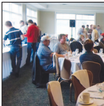
Banquet attendees dropped tickets at the raffle tables and relaxed before dinner.