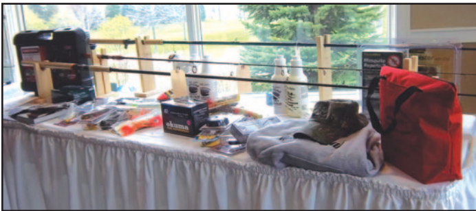
One of the many tables filled with prizes at the 2012 Sportsman's Banquet. Attendees went home with over $20,000 of prizes.