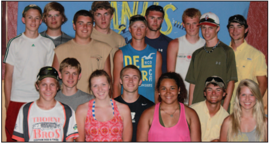
Teams from eight schools competed in the third annual Minnesota High School Tournament. The top two in regional qualifying events fished in the tournament.