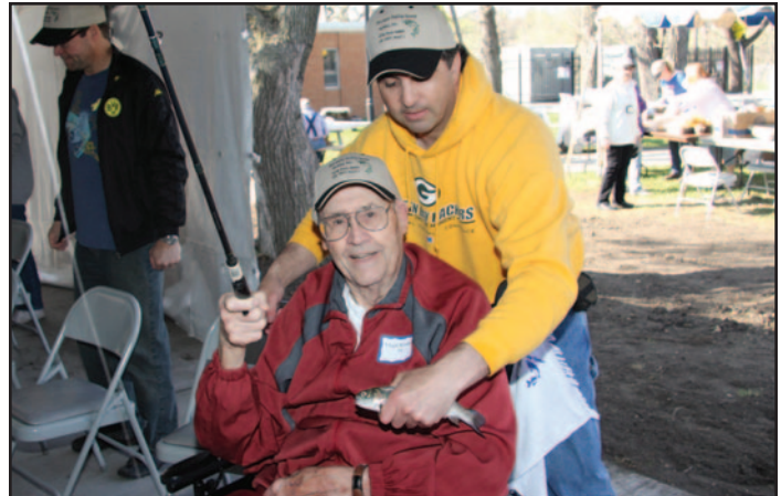
Catching a fish can make such a big smile. Join us at the Minneapolis Veteran's Home on Saturday, May 5. Help residents catch a trout, or help cooking and serving the "shore lunch".