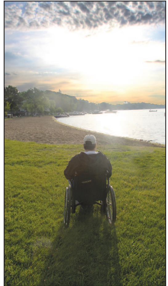
A member of the Capable Partners organization enjoying the early-morning hour at last year's outing with our chapter.