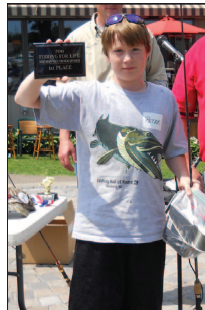
Happy winner at the 2011 Armed Forces Family Fishing Celebration showing off his plaque. Awards are given in many categories and each child participant received a "goody bag".