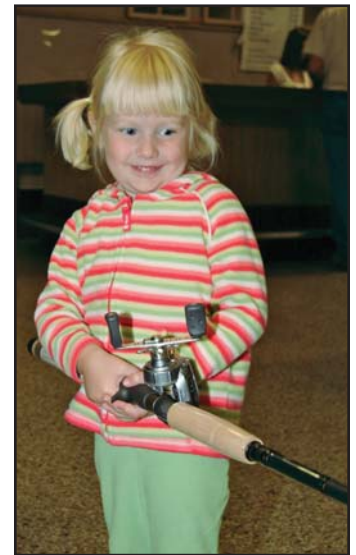
The June meeting was a combined Swap Meet and Family Night. Our youth partner Fishing For Life had games and other events for kids. The kids had a great time and those who participated went home with some great bargains.