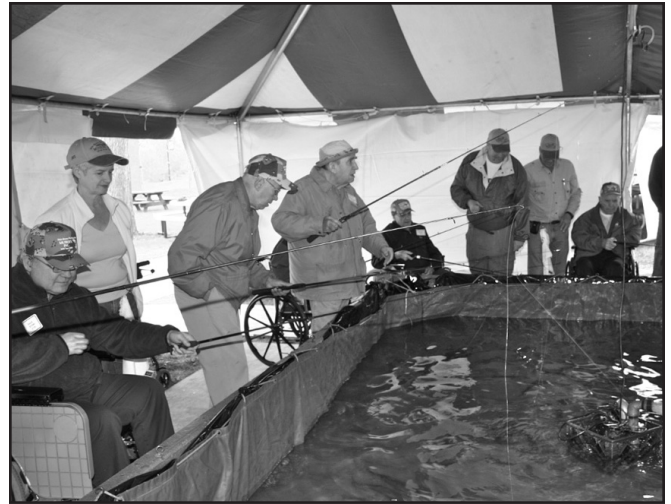
This marks the 13th year we have been setting up a trout pond at the Vet's Home. MI volunteers help residents while they fish for the trout. All the trout caught are cleaned and cooked along with all the makings of a "shore lunch" and served to the residents.