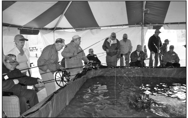
Residents from the Minnesota Veterans Home enjoyed fishing for trout in the pond set up for their "fishing opener" on May 5. A number of BIG trout were caught as well as enough to serve lunch of freshly-caught fish.