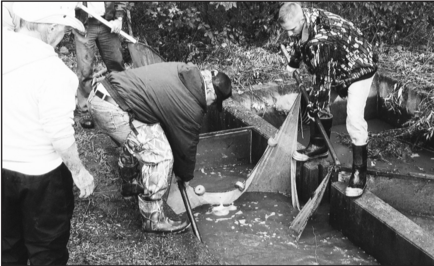
Muskie Inc Chapter 09 members worked with the West Virginia DNR to collect 150 muskie fingerlings to stock in Lake Woodrum.

Earlier this year the board voted to send MI West Virginia Chapter 09 $500 to help with a project at Woodrum Lake. A valve on the dam that controls the lake failed, the lake drained out and the entire fishery was lost. The West Virginia chapter has been working with their DNR to restore the habitat. Fields of vegetation were planted before the lake was re-filled.