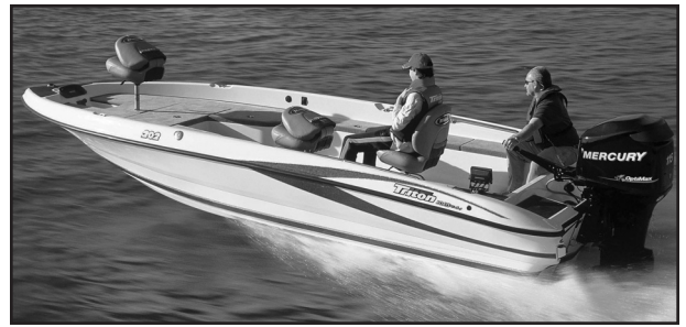
A Triton 202T with a 115 Mercury 4-stroke is the Grand Prize in the 2007 Frank Schneider, Jr. Memorial Muskie Tournament September 7, 8 and 9. Every contestant who registers a muskie in the tournament will be entered in the drawing for the Grand Prize boat package.

Since its start 40 year ago, this tournament has grown to be the biggest muskie tournament around. It's become a fishing tradition for many of the anglers who participate every year and yet every year there are many who join it for the first time. If you haven't fished the tournament before, make