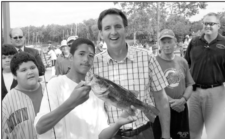
Governor Pawlenty joined inner-city youth at Lake Calhoun for an event held August 4th and 5th. The kids were given refurbished equipment, taught fishing skills and then taken fishing.