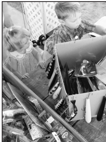
Two attendees at the Awards Banquet and Ceremony looking over just a fraction of the door prizes donated by retailers and manufacturers.