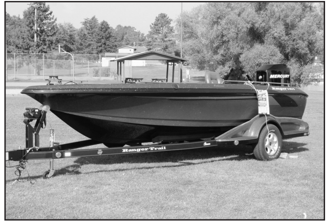
The tournament Grand Prize, a Ranger 618-T/Mercury 90 hp motor/Ranger Trail trailer/Minnkota trolling motor package.

for the Witness drawing. Two names were drawn for Lakewood tackle boxes from Thorne Bros. Fishing Specialties.