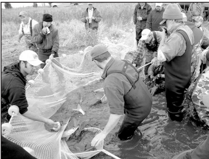
Once the muskies have been gathered in the seine net, they are netted and taken to a DNR transport truck and delivered to White Bear Lake where they were released. More pictures inside.

The rearing pond is operated in cooperation with the Minnesota Muskie Tournaments, Frankie's Live Bait & Marine and the Minnesota DNR.