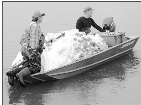
Bottom: It takes a number of volunteers to bring in the net once all the muskies have been netted and taken to the transport truck.