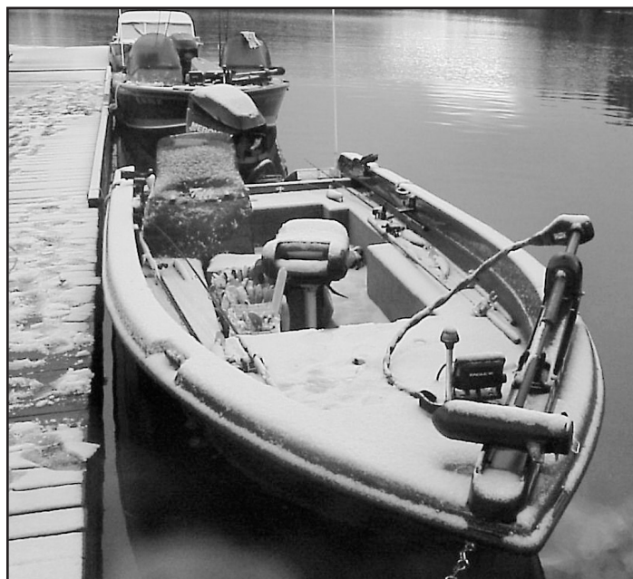
Above: Snow greeted the sixteen chapter members on the chapter-sponsored fishing trip to Crow Lake in Ontario late one September morning. Below: Paul Hartman caught this 48-1/2" fish on a 16-inch Basin Bait trolling deeper Crow Lake water.