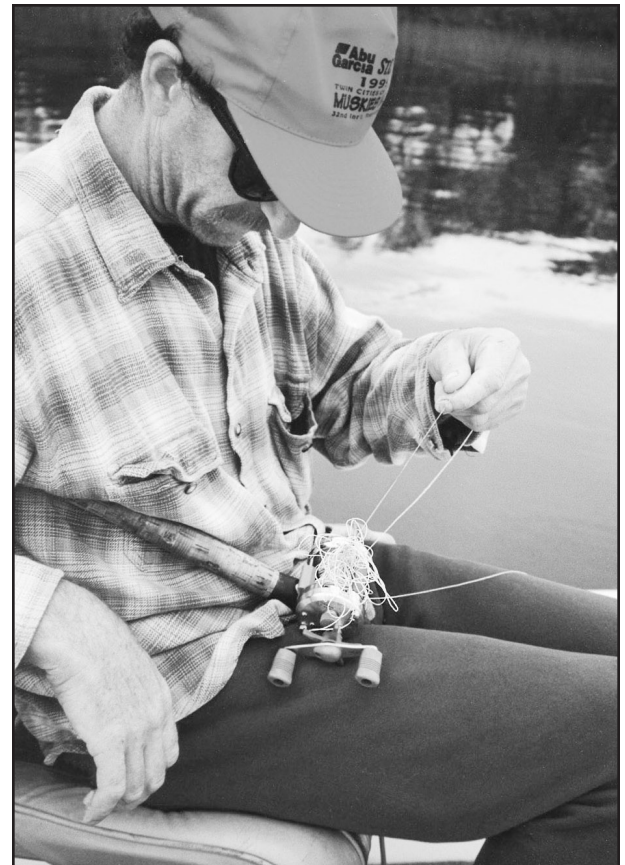
Oh, my! See story on page 3.